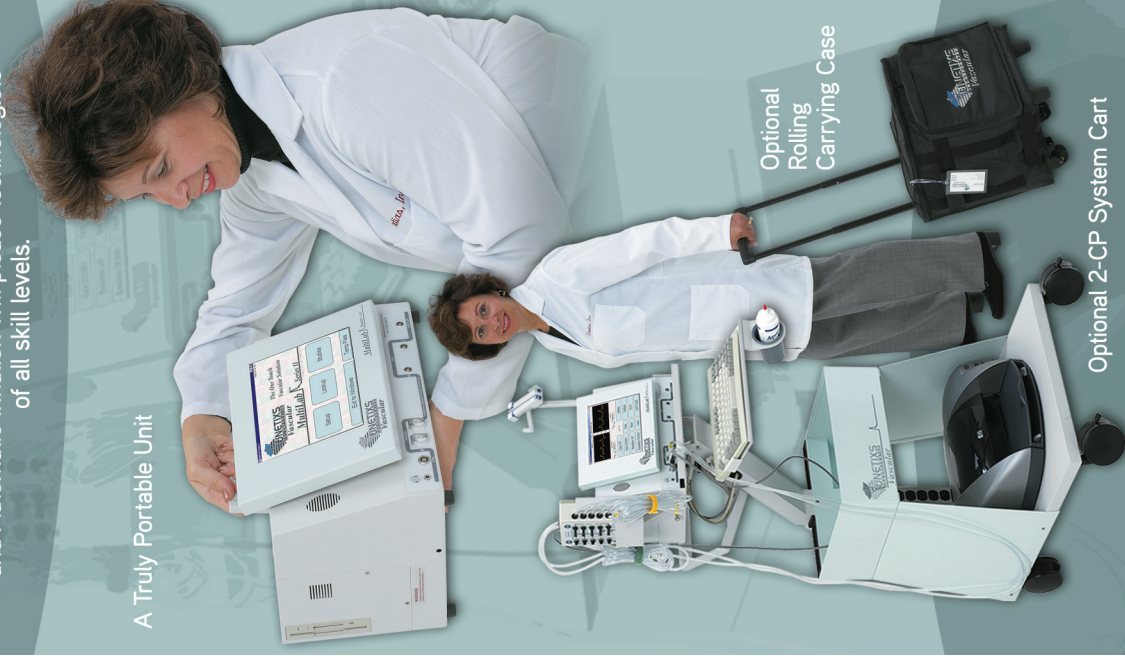
A Truly Portable Unit

Touch Screen Controls, Full-Function Electronic Manifold and Automatic Inflation will please technologists of all skill levels.